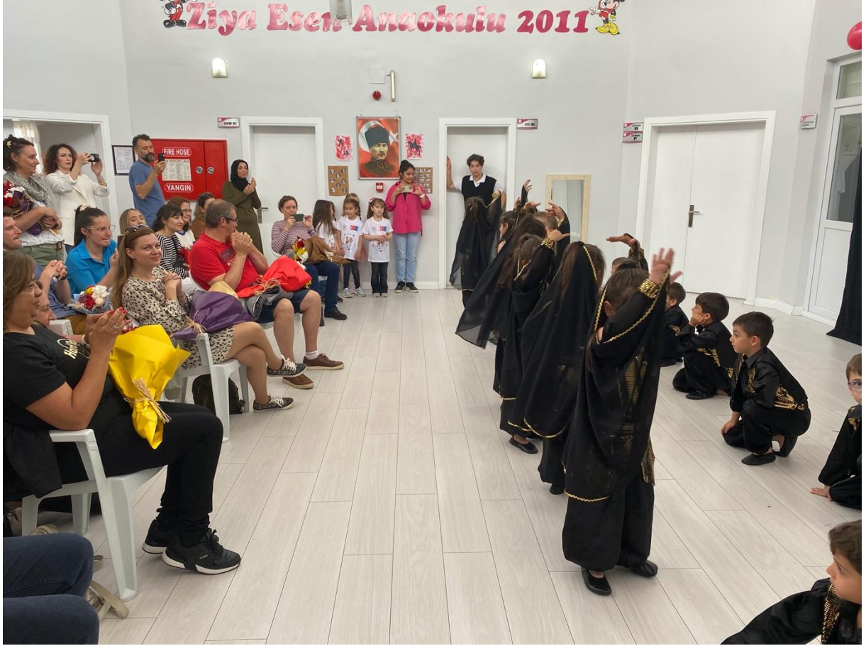
Third, our students sang the song "Smile".